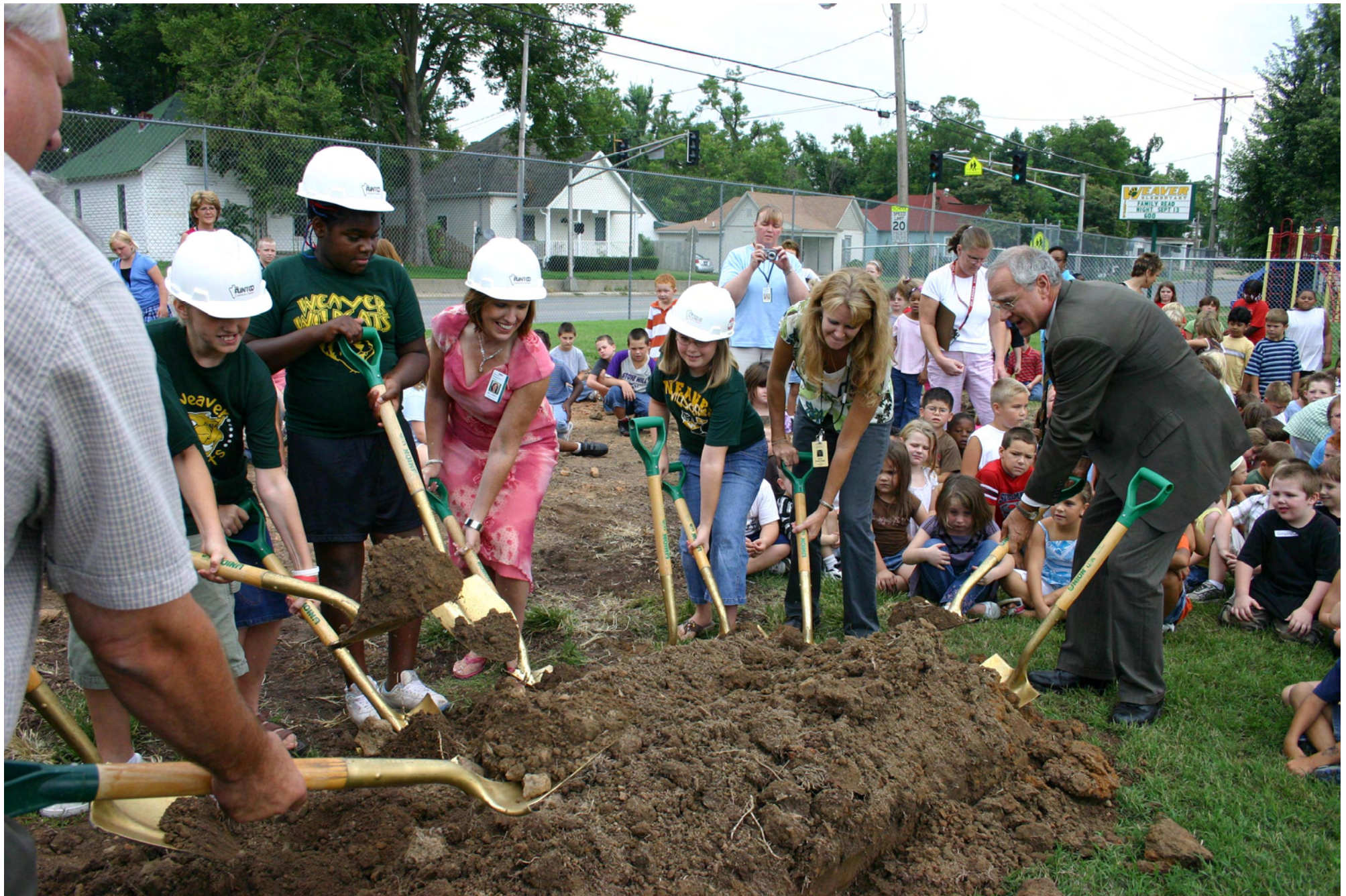
Weaver ground breaking - August 29, 2007